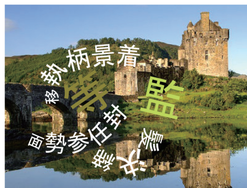
(a) Query image.